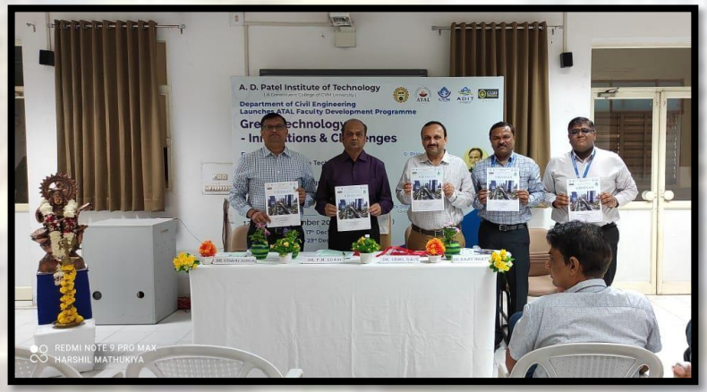
Newsletter Release 19/12/2022