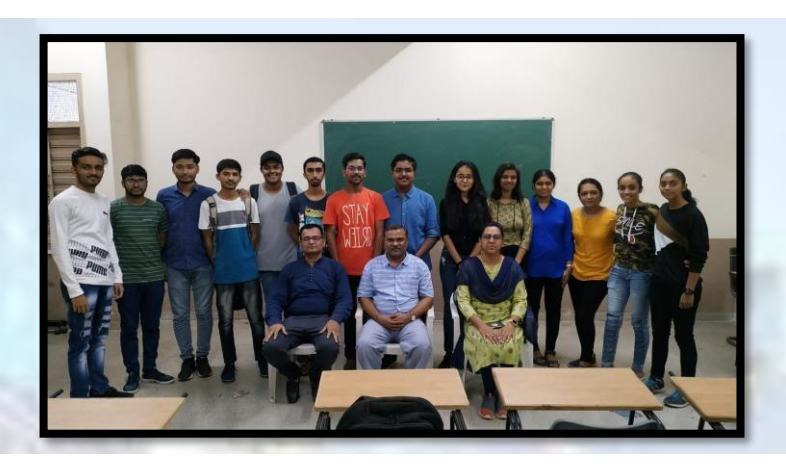
CCYOP COMPETITON ADIT 30-9-22