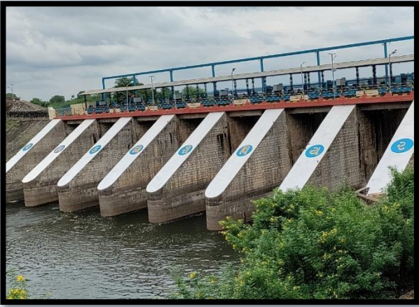
Wanakbori Weir Site Visit 07/10/22