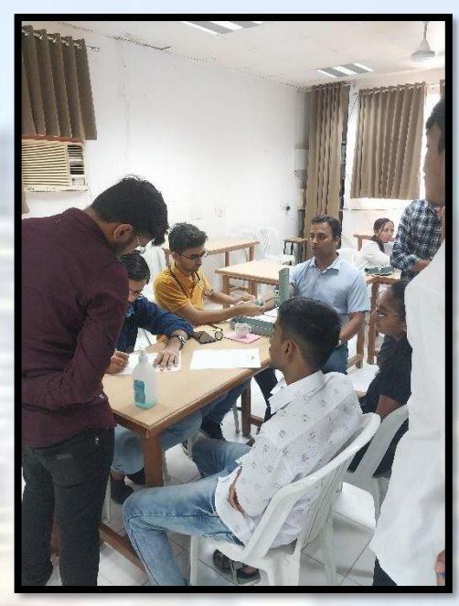
HEALTH CHECK UP CAMP 18/10/22